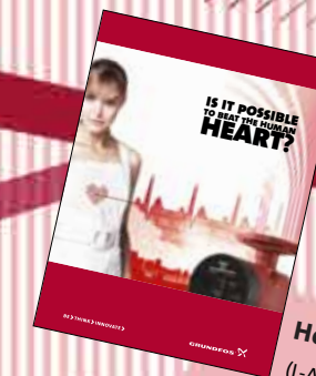
Heart insert (L-AL-SL-002)