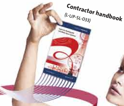
Contractor handbook (L-UP-SL-033)