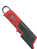
M12™ LED Stick Light 2351-20

FILL IN QUANTITY - LIMIT (2) PER CUSTOMER.