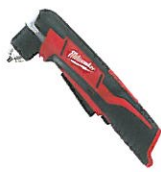
M12™ 3/8" Right Angle Drill/Driver 2415-20