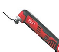
M12™ Multi-Tool 2426-20