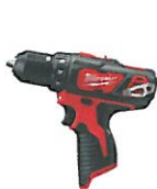
M12™ 3/8" Drill/Driver 2407-20