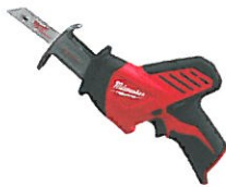
HACKZALL® M12™ Recip Saw 2420-20